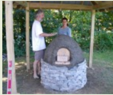
We built a cob oven for baking- it's still drying so we haven't gotten to use it yet! Very soon I suspect.....

For more information, please visit the web site listed below.